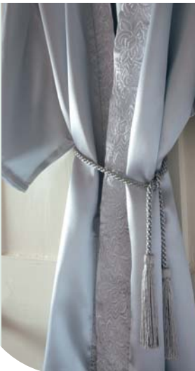
15693 Crepe Cord