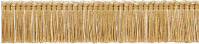
8886 Brush Fringe