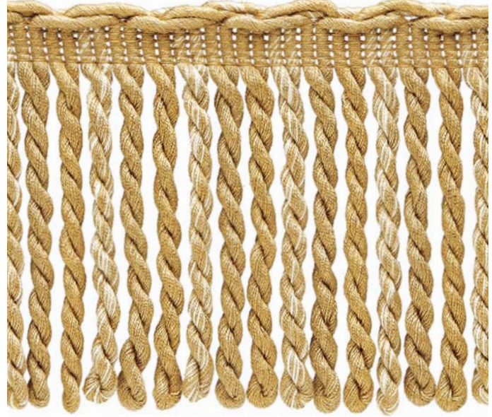
T08900 Bullion Fringe