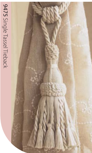
9475 Single Tassel Tieback

The Oxford Collection offers performance, durability and fantastic value for money.