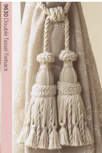
9630 Double Tassel Tieback