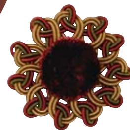
Style 21768 Rosette