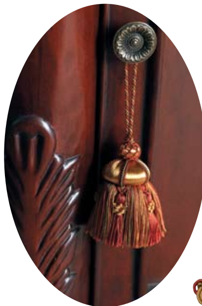
Style 21769 Key Tassel