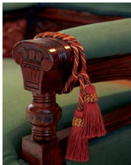
Style 21770 Chair Tie