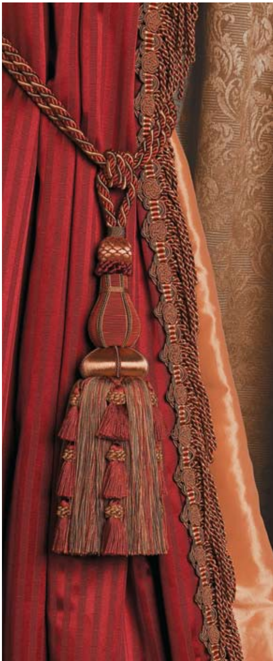
Style 21771 Large Single Tassel Tieback