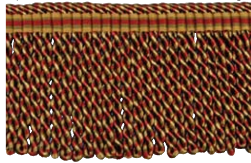
Style 21767 Bullion with Decorative Header