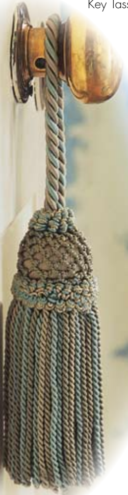
Style 21201 Key Tassel