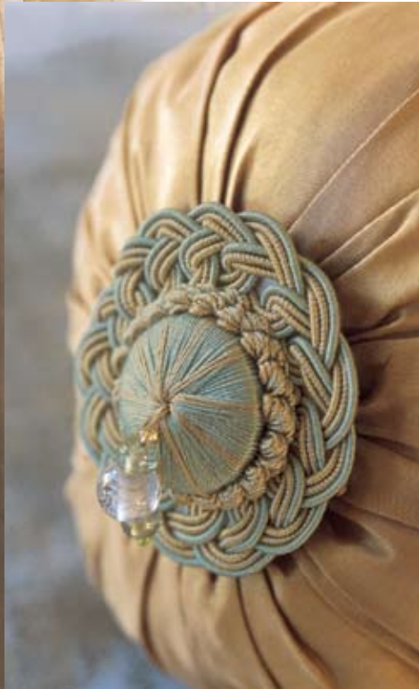
Style 21211 Rosette with Bead