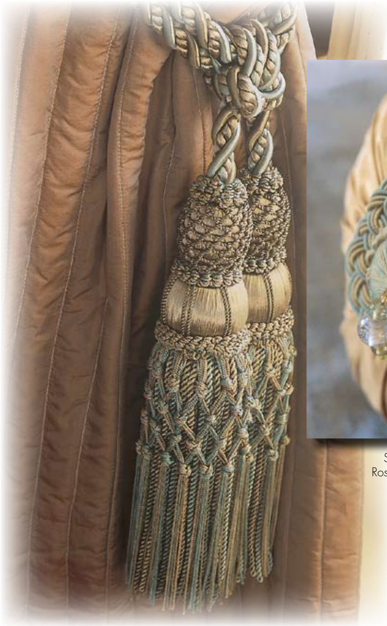
Style 21204 Double Tassel Tieback