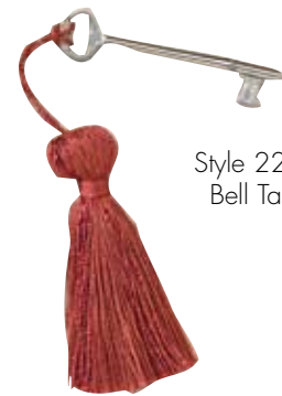
Style 22051 Bell Tassel