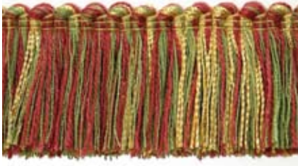
Style 22028 Brush Fringe