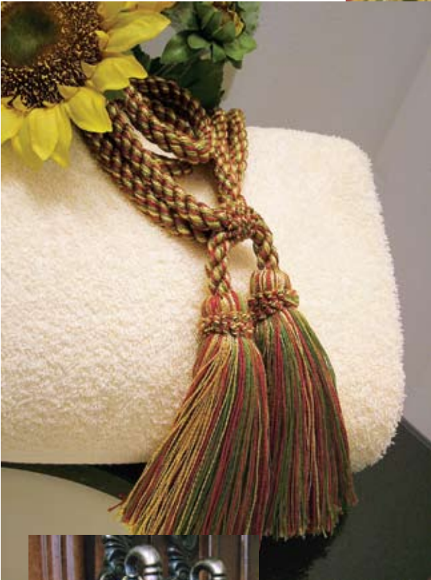
Style 22034 Twisted Cord Tieback