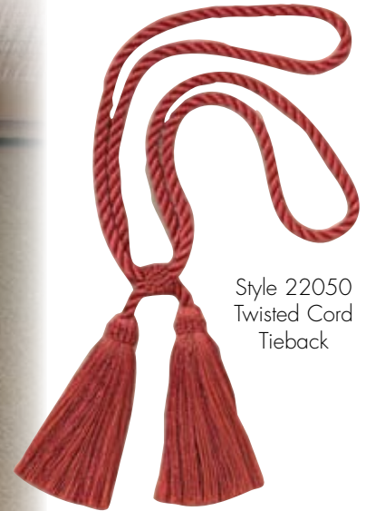
Style 22050 Twisted Cord Tieback