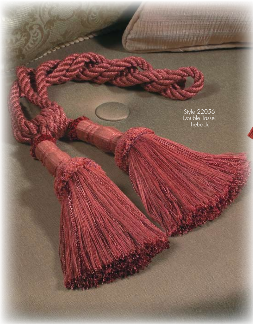
Style 22056 Double Tassel Tieback