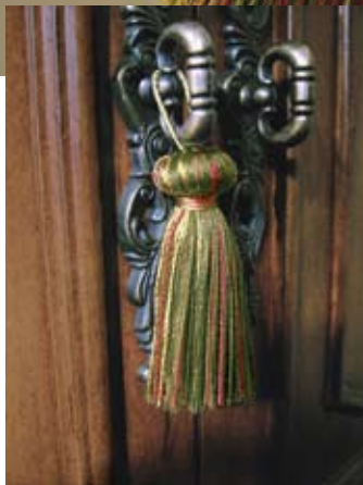
Style 22038 Bell Tassel