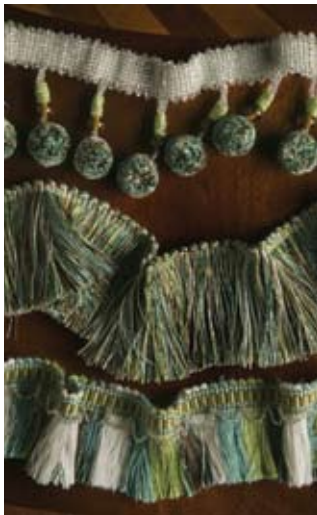
VL12 Cocoa Lime