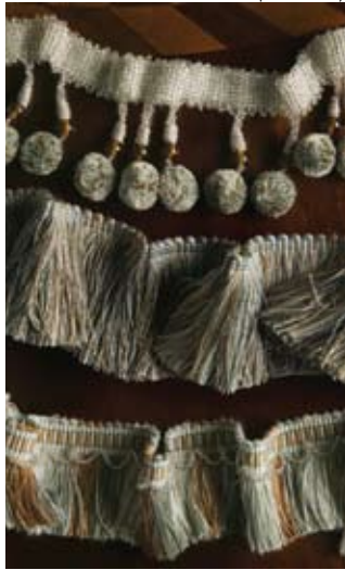
VL05 Taupe Grey