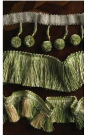
VL11 Lime Green