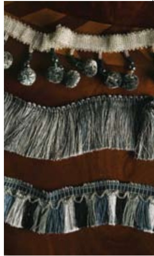
VL10 Black Grey