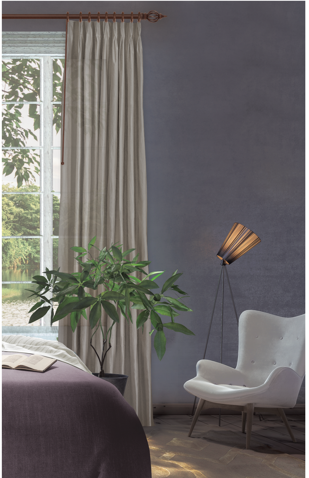
BIRD CAGE Rust Shown