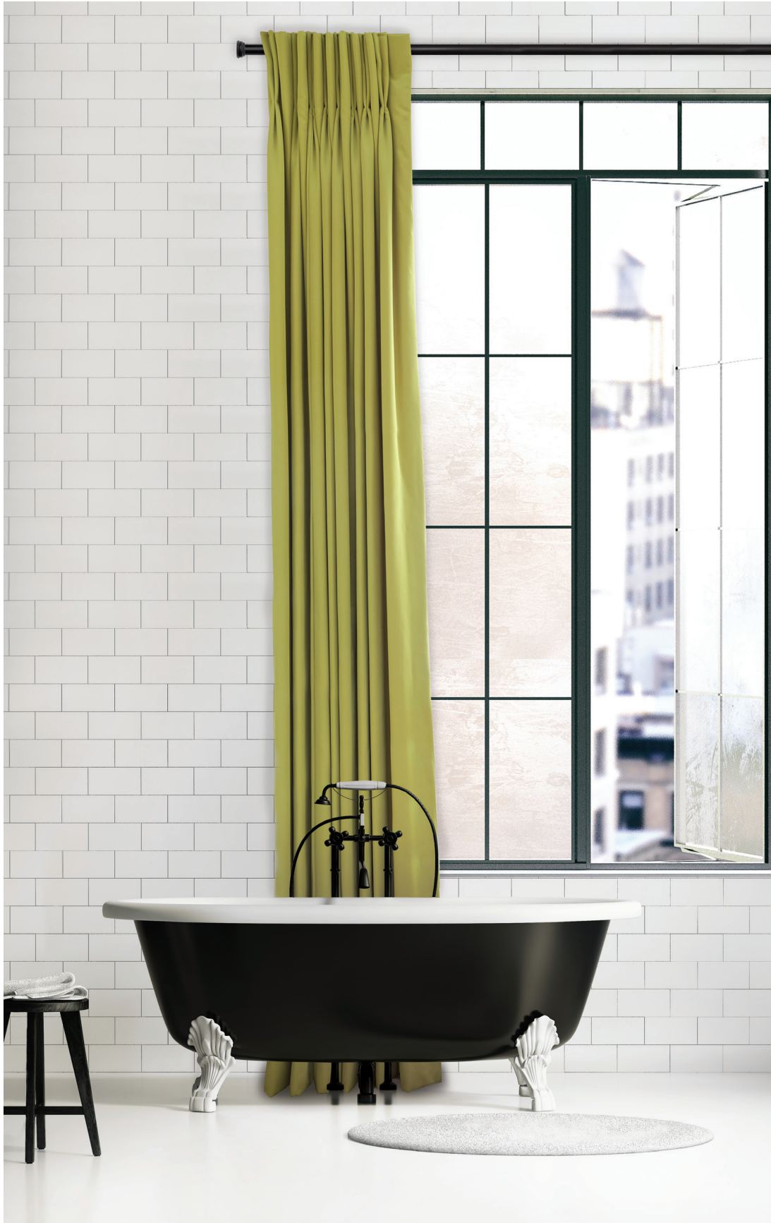
ENDCAP Black Shown