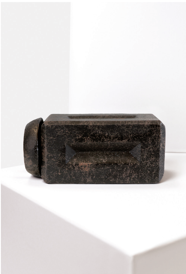
BEVELED BRICK Iron Oxide shown. Size 1". Available in all colors.