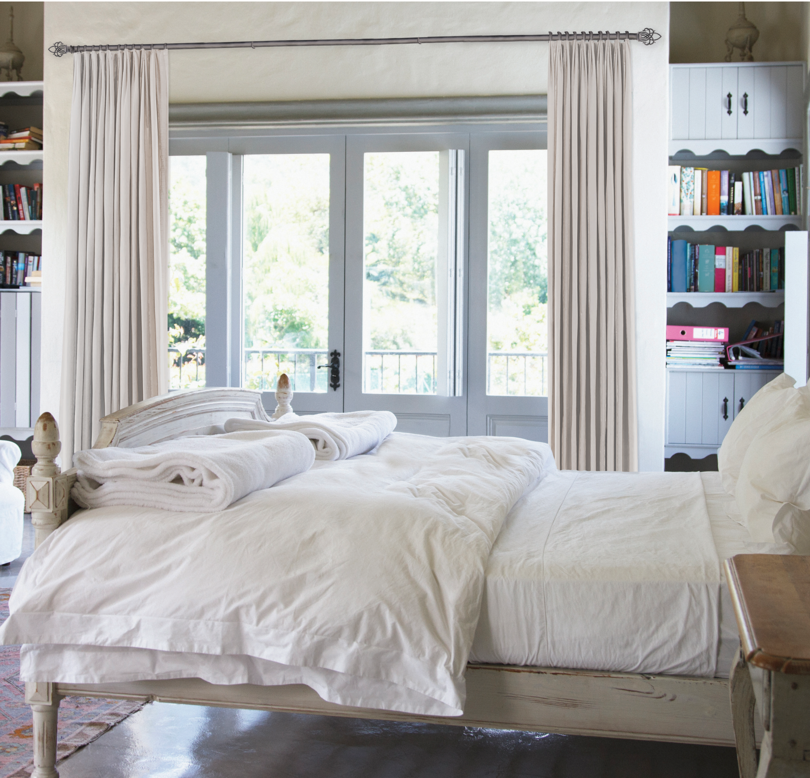
INNER LACE Antique Pewter Shown