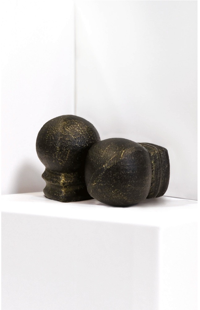
PETITE MODERN BALL Iron Gold shown. Size 1". Available in all colors.