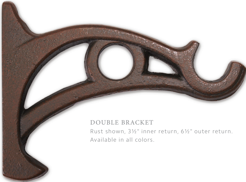
DOUBLE BRACKET Rust shown, 3½" inner return, 6½" outer return. Available in all colors.