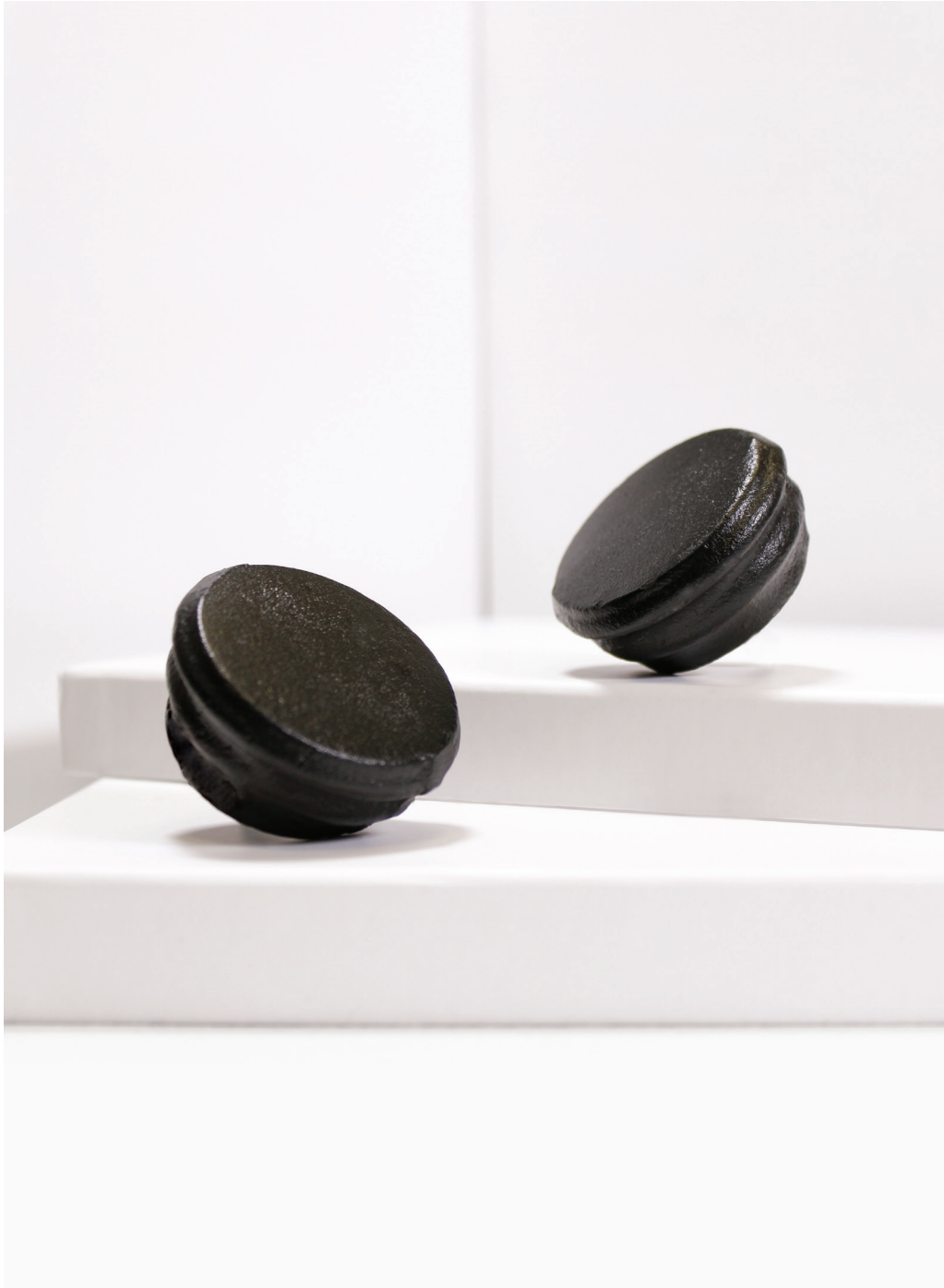
ENDCAP Black shown. Size 1". Available in all colors.