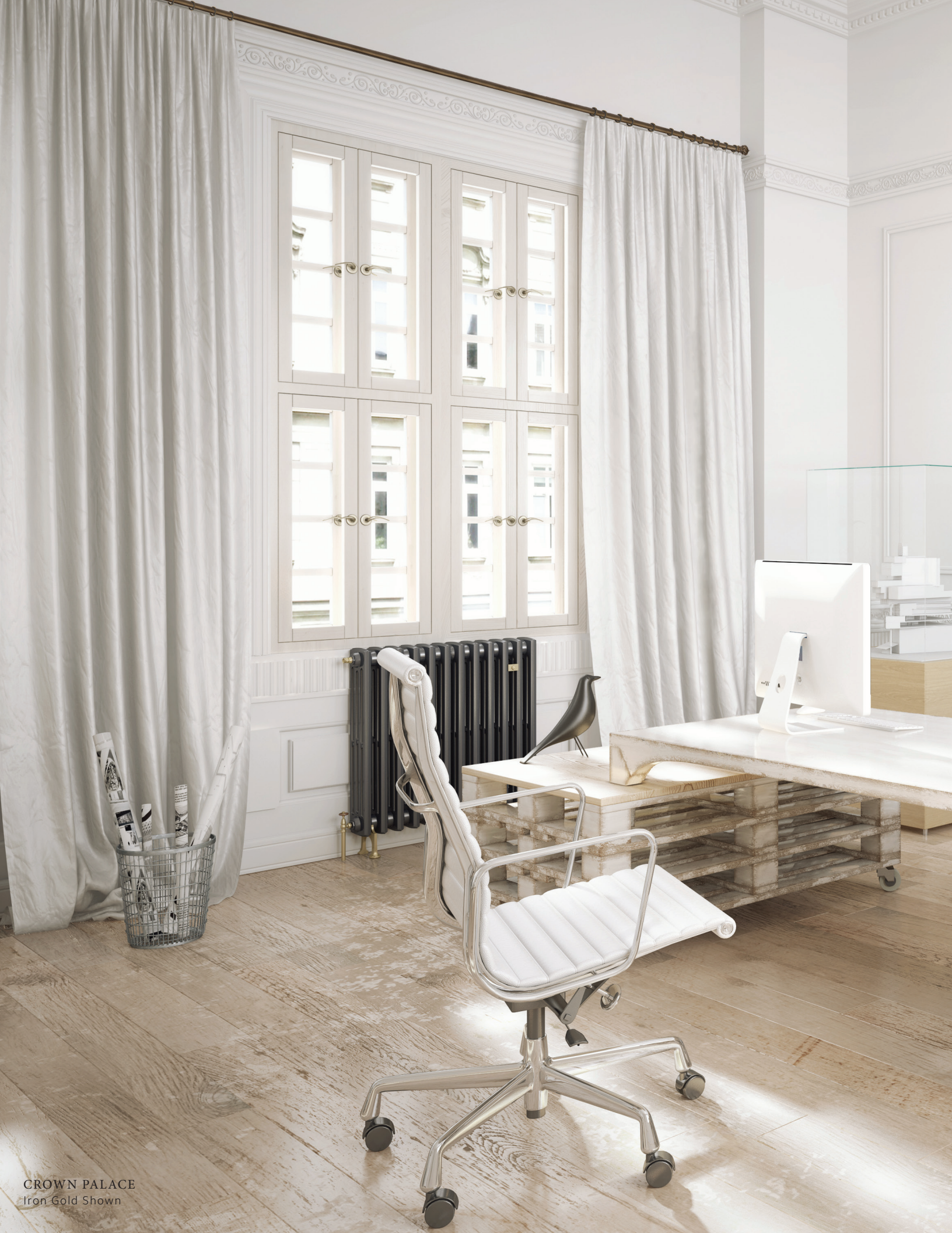
CROWN PALACE Iron Gold Shown