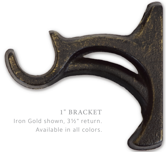
1" BRACKET Iron Gold shown, 3½" return. Available in all colors.