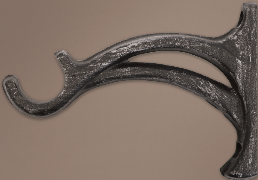
1" BRACKET Antique Pewter shown, 5½" return. Available in all colors.