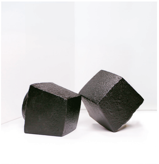
PETITE FAUCET Black shown. Size 1". Available in all colors.