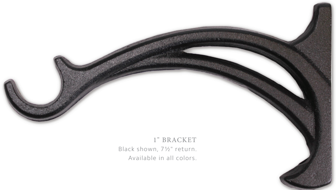
1" BRACKET Black shown, 7½" return. Available in all colors.