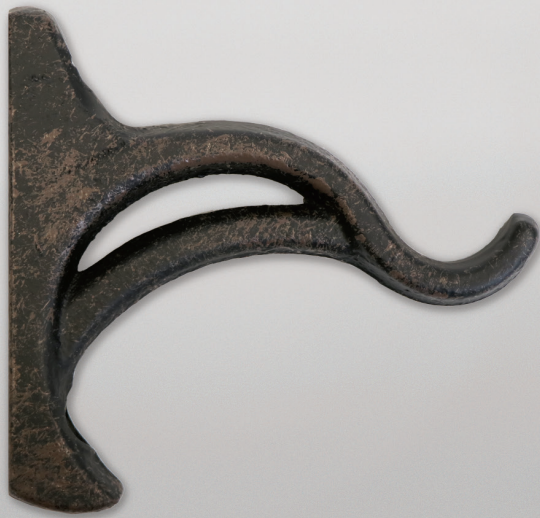
CENTER BYPASS BRACKET Iron Oxide shown, 3½" return. Available in all colors.