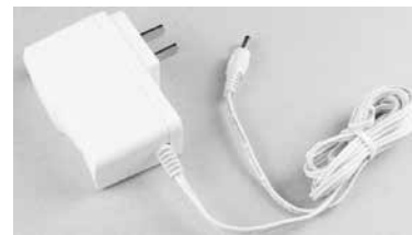
Charger for Remote Controlled Motor