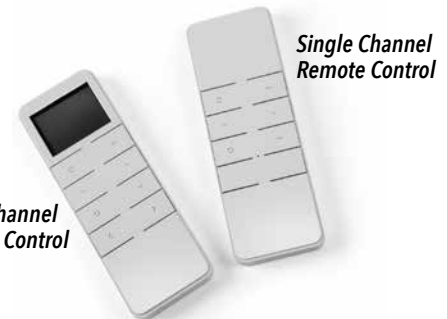
Multi-Channel Remote Control