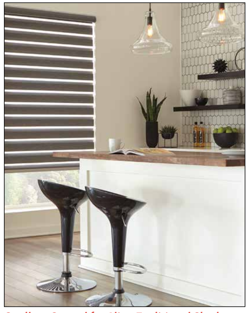
Cordless Control for Align Traditional Shades Simply pull down or push up the shade to the desired position.