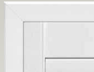
Bullnose Z Frame (1 1/2" or 2")