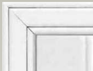
Vintage L Frame