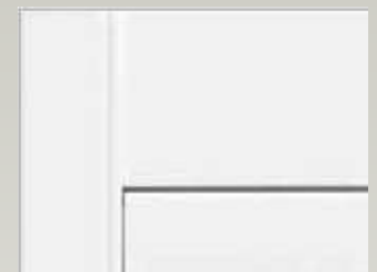
Vintage Hang Strip (OM)