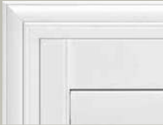
Camber Deco Frame