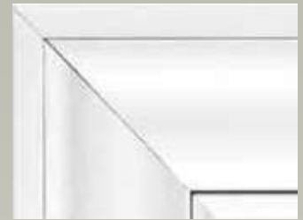
Ridge Deco Frame