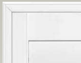
Beaded L Frame