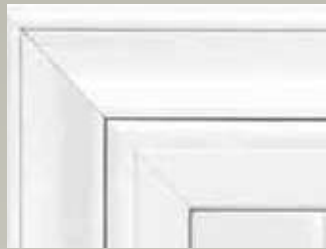
Classic Deco Frame