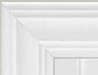
Crown Z Frame