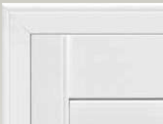
Beaded Z Frame