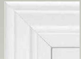
Bel Air Z Frame