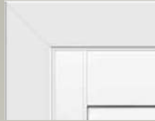
Mission Deco Frame