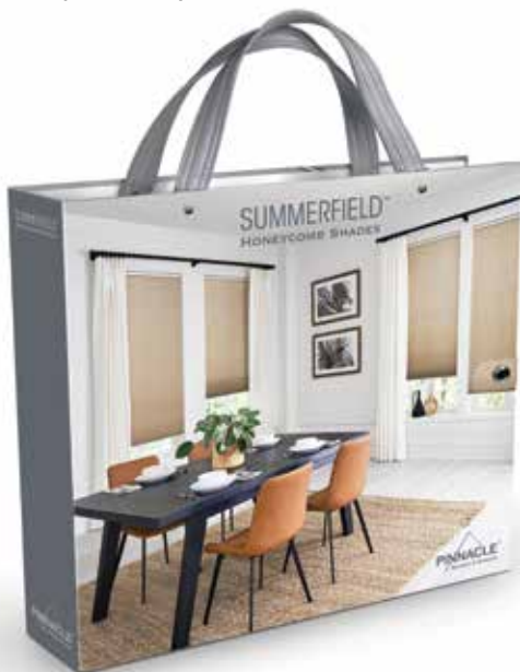
Summerfield™ Honeycomb Sample Book Item #PNCELL-2025 $299.00