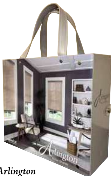
Arlington Roller Shades Sample Book