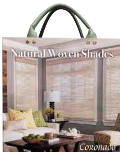
Coronado Natural Woven Shades Sample Book