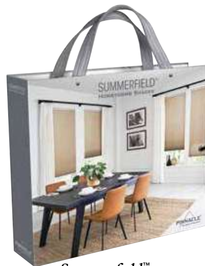
Summerfield™ Honeycomb Shades Sample Book