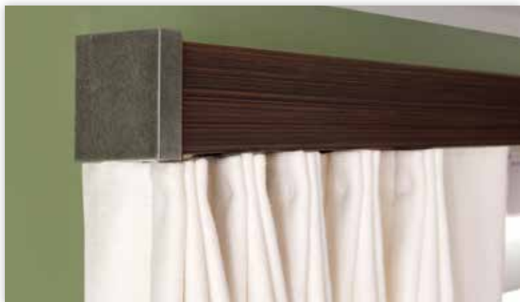
Select Wood Flat Fascia Traverse Rods: Shipped with the Finials, End Caps, or Elbows attached.