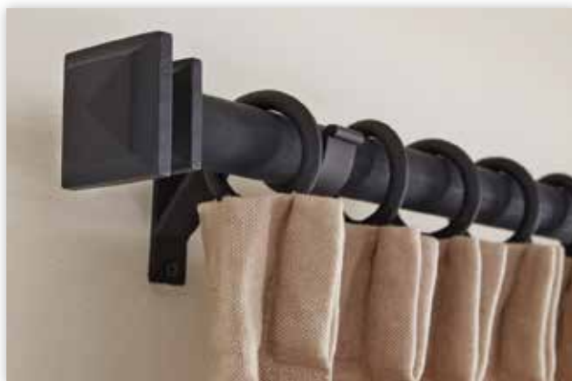
Iron Image: Finials in four designs with matching rings available.