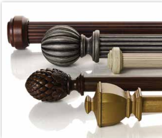
Select Wood Smooth or Reeded Poles: Matching finishes to a wide choice of finials, end caps, brackets, rings and accessories.

Select Wood Flat Fascia Traverse Rods , for a more contemporary design, Select Wood Flat Fascia can be added to Select Traverse Rods in one of five Select finishes – Bronze, Mocha, Black, White, Platinum, or Unfinished. Complete the look with Custom Mitered Returns, Square Wood Finials, Square Mitered Elbows, or Square Metal End Caps, all options must be ordered separately and are available with a surcharge.