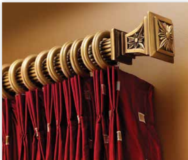
Select Wood Traverse Rods: Finely detailed finials and traverse rods with elegant finishes are hallmarks of Select Wood Drapery Hardware.